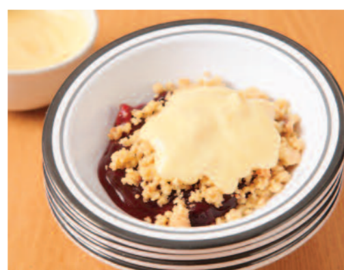
Fruit Crumble & Custard