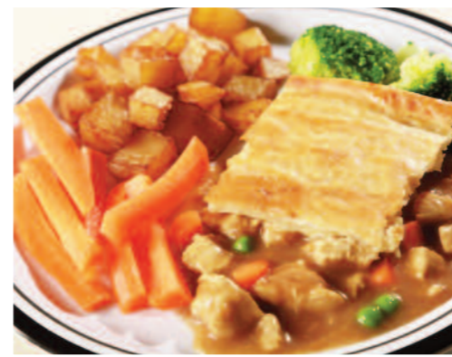
Homemade Chicken Pie served with Diced Crispy Potatoes & Seasonal Vegetables