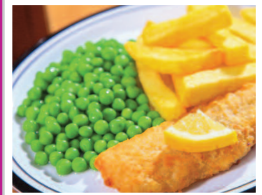
Battered Fish (MSC) served with Chips & Peas or Baked Beans