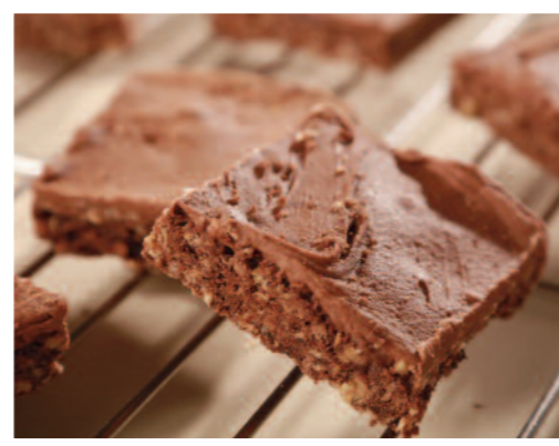
Iced Chocolate Oaty Square