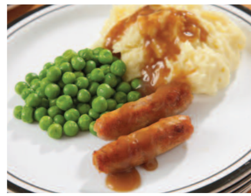
Sausages served with Mashed Potato, Seasonal Vegetables & Gravy