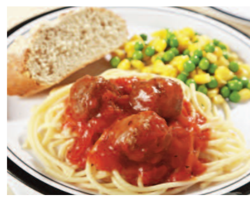
Meatballs in Tomato Sauce served with Spaghetti, Garlic & Herb Bread and Seasonal Vegetables