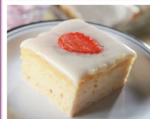
Strawberry Ice Cream Cake