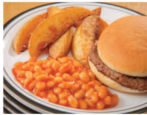
Beef Burger served in a Bun with Potato Wedges & Seasonal Vegetables or Baked Beans