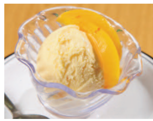
Ice Cream & Fruit