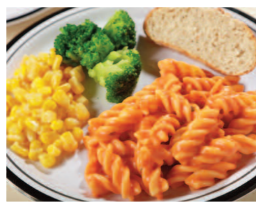
Tomato & Mascarpone Cheese Pasta served with Garlic & Herb Bread and Seasonal Vegetables