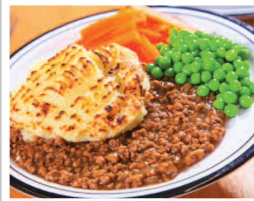
Cottage Pie served with Seasonal Vegetables