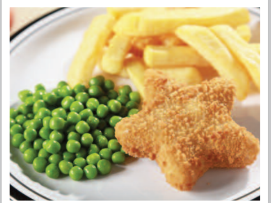
Fish Star (MSC) served with Chips & Peas or Baked Beans