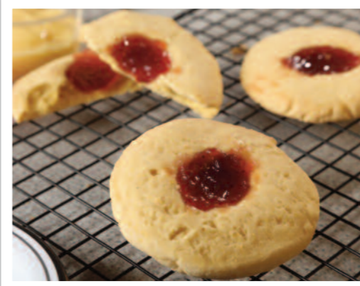
Jam & Custard Biscuit