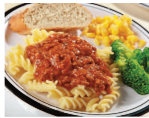
Pasta Bolognese served with Garlic & Herb Bread and Seasonal Vegetables