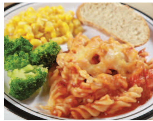
Cheese & Tomato Pasta served with Garlic & Herb Bread and Seasonal Vegetables