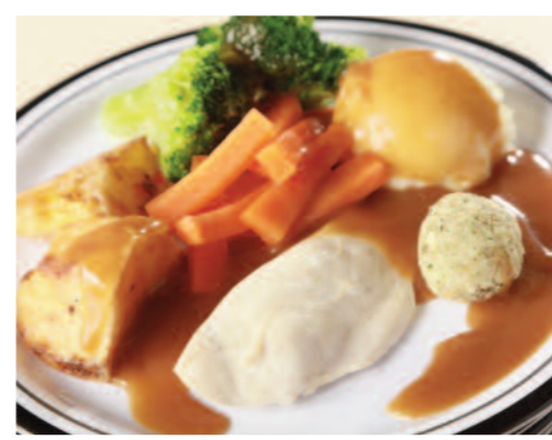
Roast Chicken served with Roast/Mashed Potatoes, Seasonal Vegetables & Gravy