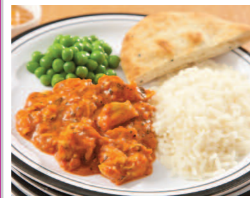
Chicken Tikka Masala served with Rice, Naan Bread & Seasonal Vegetables