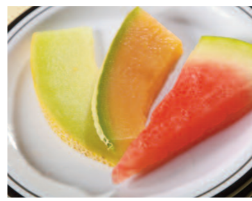
Trio of Melon