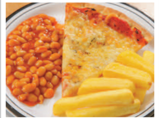
Cheese & Tomato Pizza served with Chips & Peas or Baked Beans