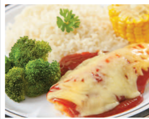
BBQ Chicken served with Savoury Rice and Seasonal Vegetables