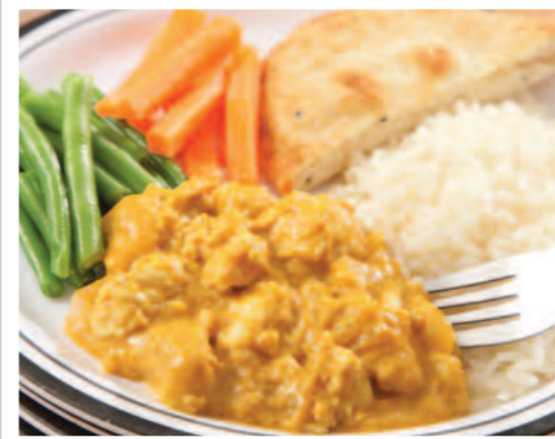
Chicken Korma served with Rice, Naan Bread & Seasonal Vegetables