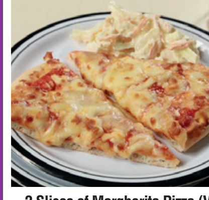
2 Slices of Margherita Pizza (V) served with Baked Beans. Seasonal Vegetables or Coleslaw