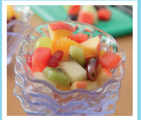
Fresh Fruit Salad