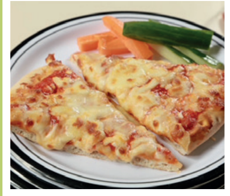
2 Slices of Thin & Crispy Cheese & Tomato Pizza (V), served with Baked Beans, Seasonal Vegetables or Coleslaw