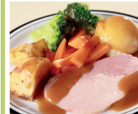
Roast Gammon Lunch served Roast/Mashed Potatoes. Seasonal Vegetables & Gravy