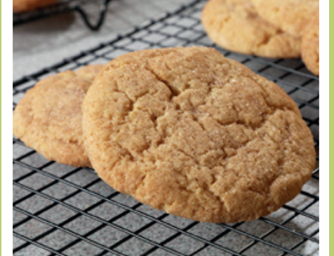
Snicker Doodle Biscuit