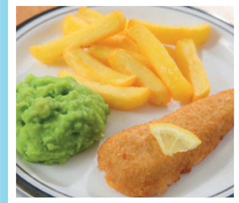
Breaded Fish served with Chips, Baked Beans or Peas