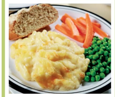
Mac 'n' Cheese (V) served with Crusty Bread & Seasonal Vegetables