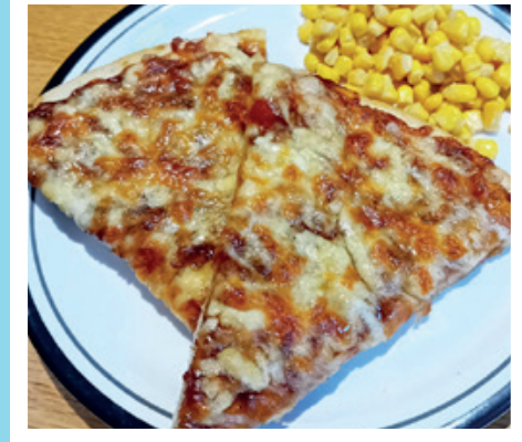
2 Slices of Texas BBQ Pizza (V) served with Baked Beans, Seasonal Vegetables or Coleslaw