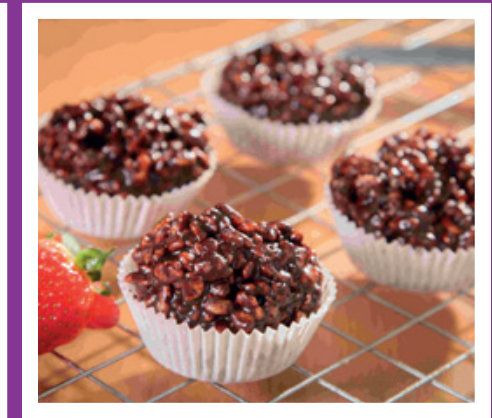
Chocolate Crispy Cake