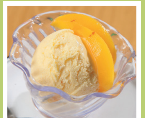
Vanilla Ice Cream & Fruit