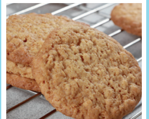
Rice Crispy Cookie