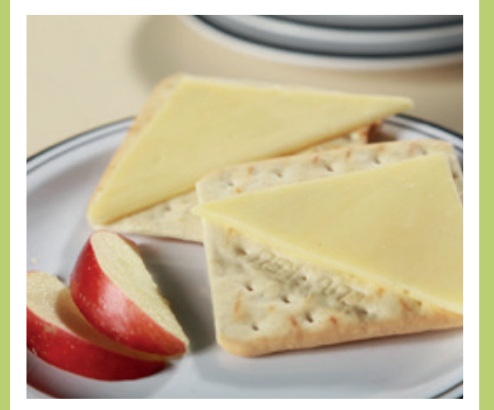
Cheese & Crackers