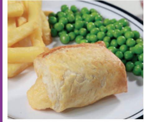
Oven Baked Cheddar Cheese & Onion Roll (V) served with Chips, Baked Beans or Peas