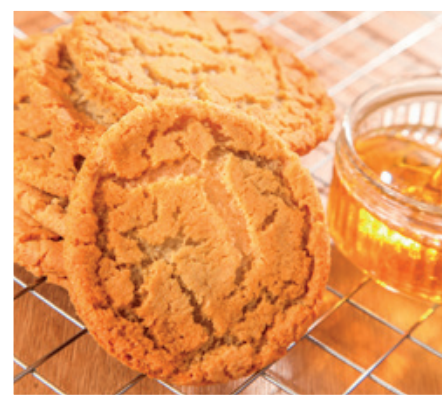
Golden Crunch Biscuit