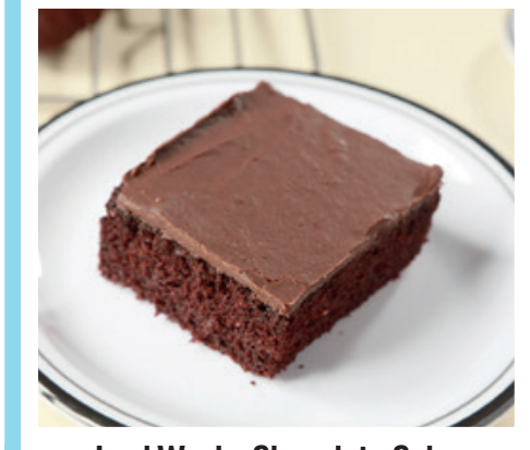
Iced Wacky Chocolate Cake